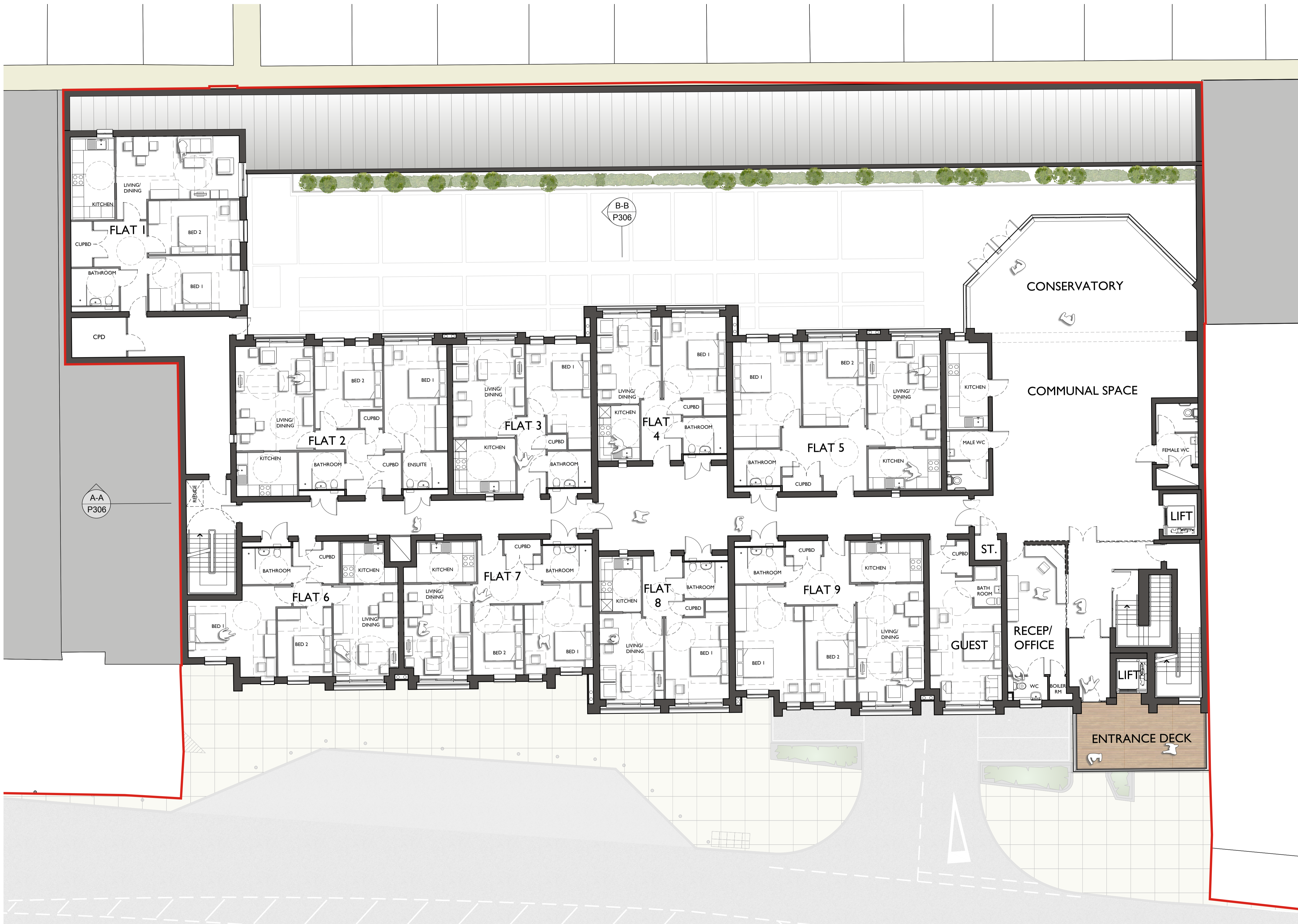
PROPOSED LAYOUT LEVEL 1